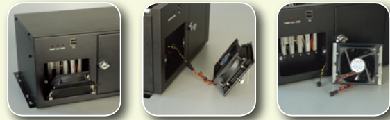
Step 1: Loosen the thumb screws Step 2: Pull the fan out gently Step 3: Unplug the power connector