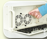
Step 1: Loosen the thumb screws