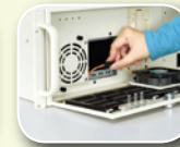
Step 3: Unplug the power connector