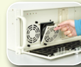
Step 2: Pull the fan out gently