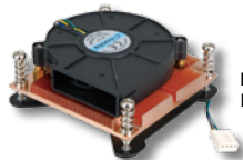
LGA1156 Cooler IEI P/N: CF-1156A-RS