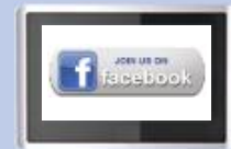
Promotional Social Media: Facebook, Twitter