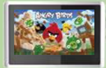
Entertainment: Games / Movies / Internet