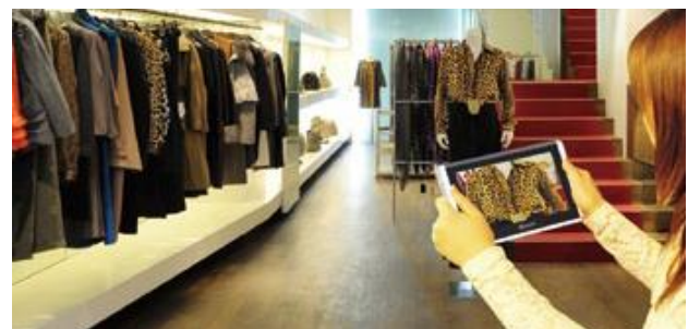
Retail Store Management